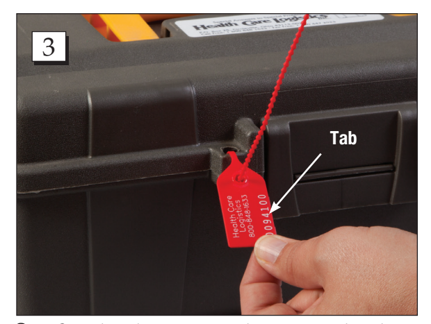
Step 3. Utilize the "TUG" test by grasping the tab of the seal, gently tug on it to determine closure. If you are able to loosen the seal, IT IS NOT FULLY LOCKED. Remove the seal and replace with a new one.