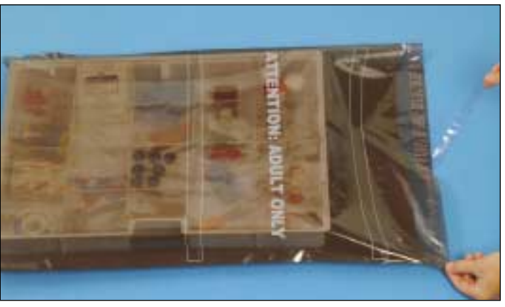
2. Pull the paper backing off the edge of the bag to expose the adhesive tape.