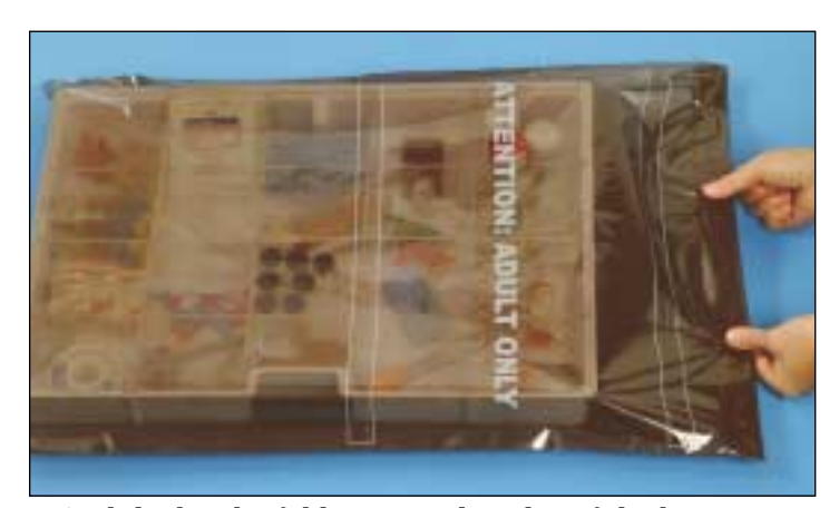
3. Seal the bag by folding over the edge of the bag.