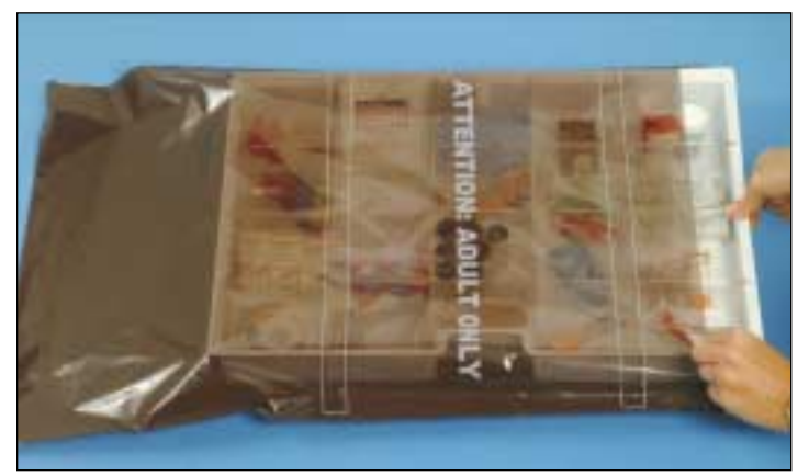
1. Insert the crash cart box into the opening of the crash cart bag.