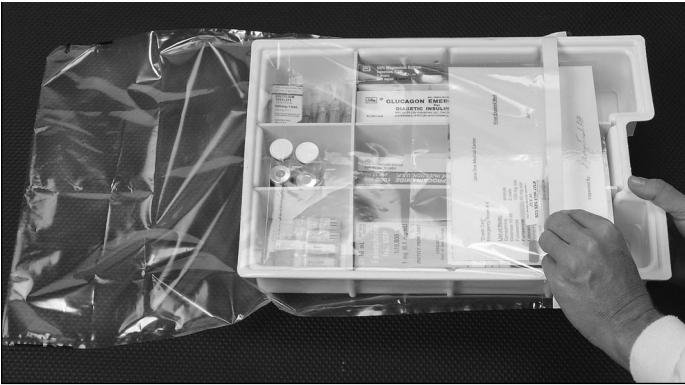
1. Insert the crash cart box into the opening of the crash cart bag.