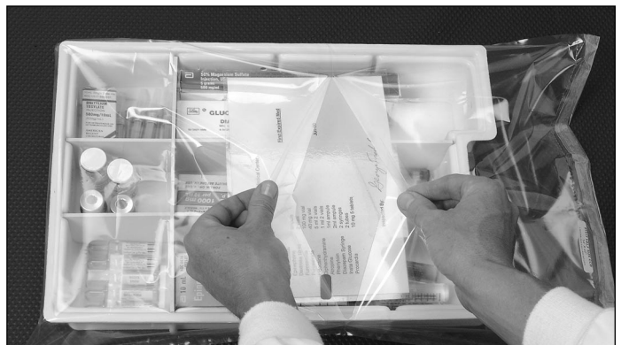
4. To open the bag, remove the box from the cart drawer and tear at the center perforation. Pull one half to the left and the other to the right.