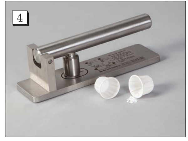
Step 4. Remove the cups from the crusher and administer.