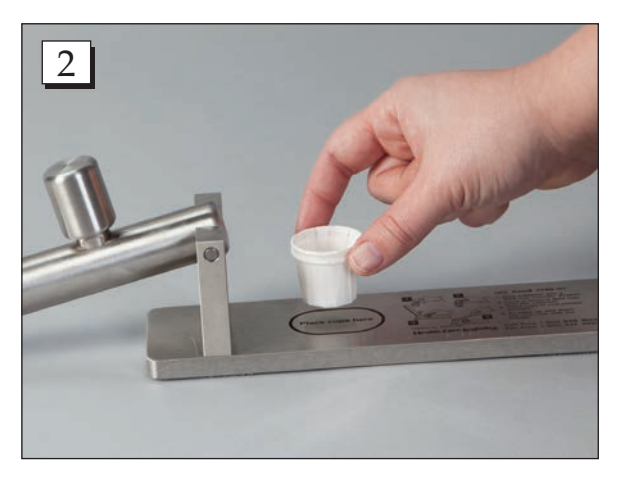
Step 2. Cover with another crush cup and place on tablet crusher.