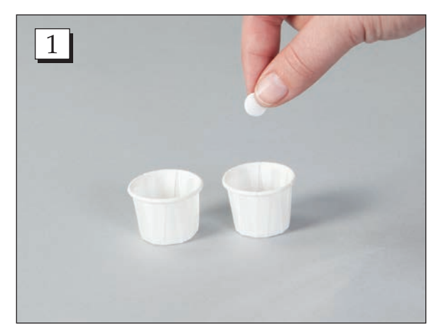
Step 1. Place tablet(s) into a ½ oz. crush cup.