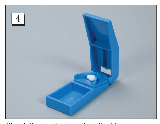
Step 4. Open and remove the split tablet.