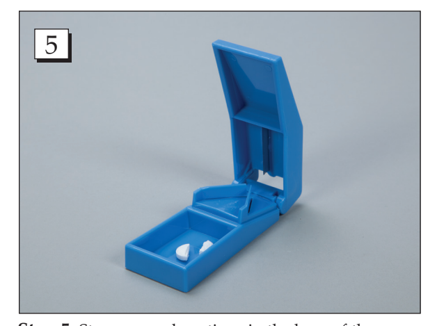
Step 5. Store unused portions in the base of the Tablet Cutter.

NOTE: Please do not split enteric coated tablets.