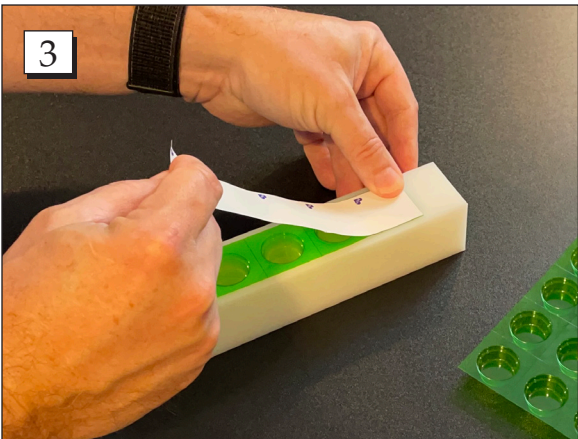
Step 3. Remove five labels from the roll and align to the blisters.