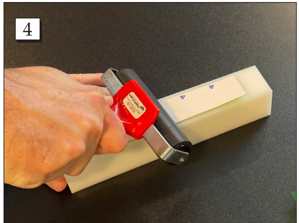
Step 4. Use the roller with firm pressure to adhere the labels to the blisters.