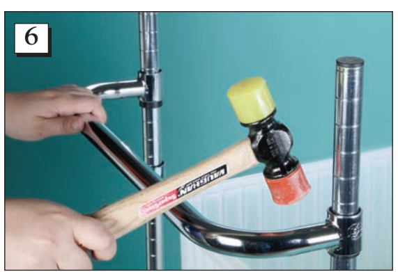
Step 6. Tap into place with a rubber mallet.