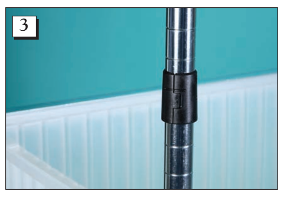
Step 3. Squeeze the two parts together until they click together.