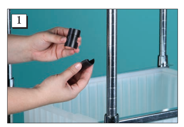
Step 1. Gather one sets of plastic sleeves. Choose the height you want to set the handle at. Place the first clip on the pole.

Note: You will need a small rubber mallet to secure the handle in place.