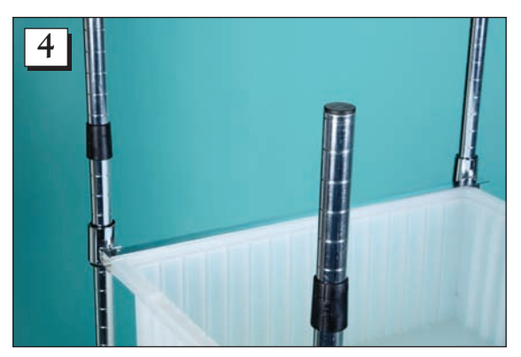
Step 4. Repeat steps 1-3 on the other side.