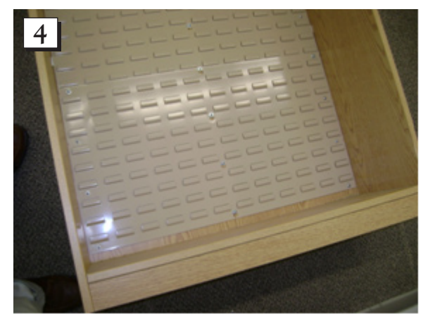
Step 4. Repeat steps 2 and 3 until all of the panels are secured into position.