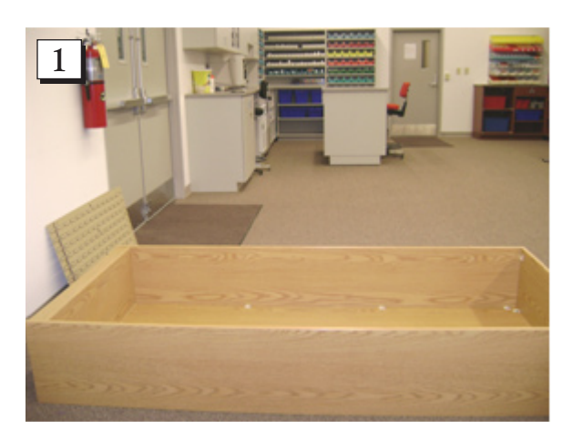
Step 1. Start by laying the cabinet down on the floor.