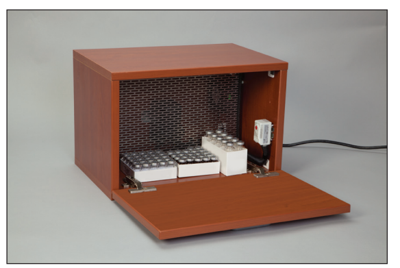
Step 2. After 24 hours place content inside of the warming cabinet and shut the door.