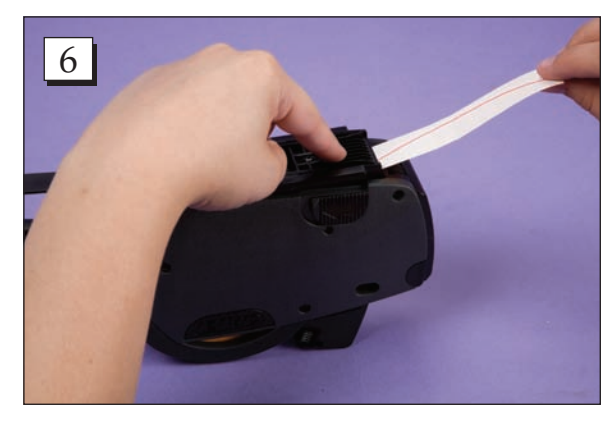
Step 6. Press until the assembly clicks.