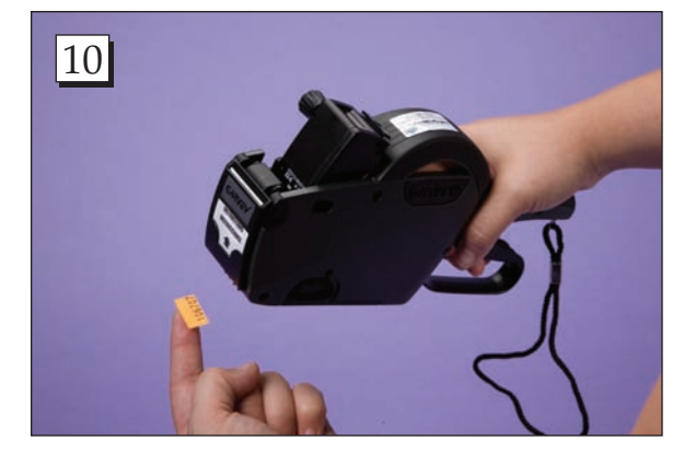
Step 10. Now the label gun is ready to use.