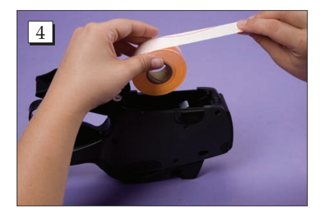
Step 4. Load the labels dropping them into the gun.