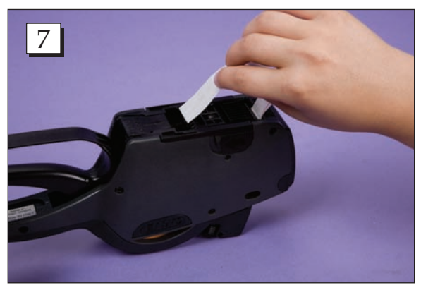
Step 7. Feed the tape through the feed drive wheel on the side closest to the handle.