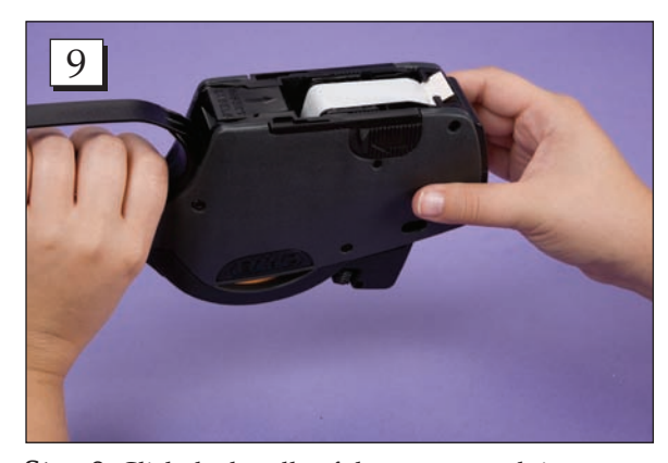
Step 9. Click the handle of the gun several times to progress the tape through the gun.