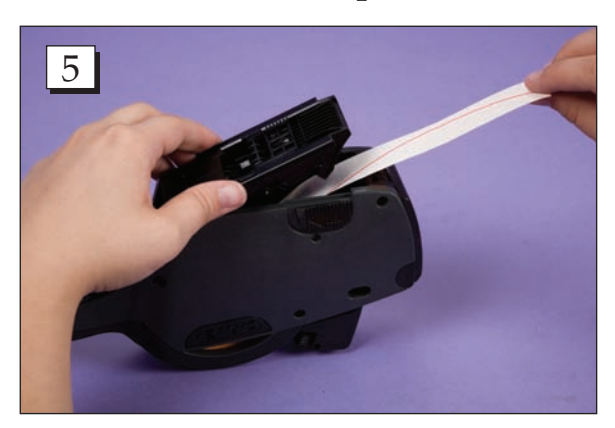
Step 5. Pull the tail out and close the bottom assembly.