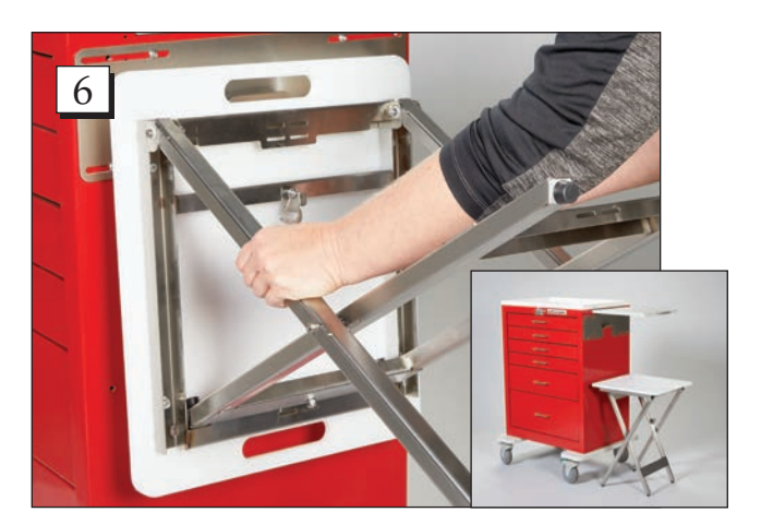
Step 6. Remove the seat from the plate.