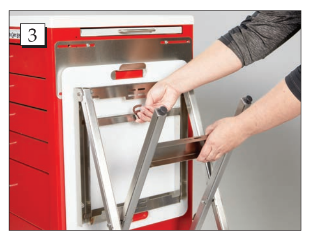
Step 3. Pull inside frame outward.