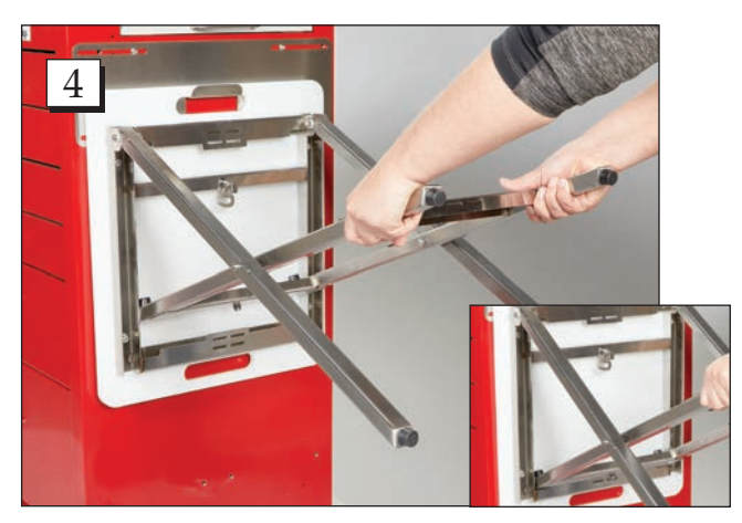
Step 4. Insert legs into pocket.