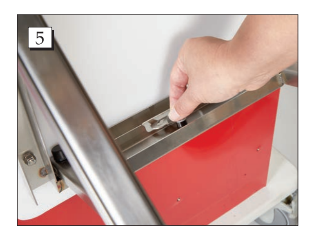
Step 5. Latch bottom retention clasp to lock the legs in place.