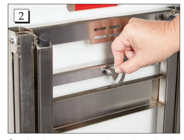
Step 2. Release top retention clasp on the underside of the folding seat.