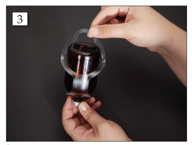
Step 3. Pull up on the notched portion of the large cutout.