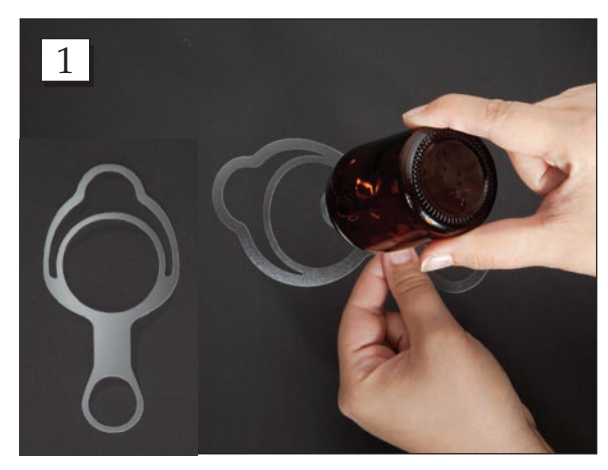
Step 1. Slide the vial into the large round cutout of the bottle holder.