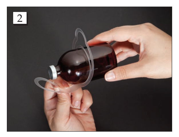
Step 2. Flip the small round cutout over the neck of the vial.