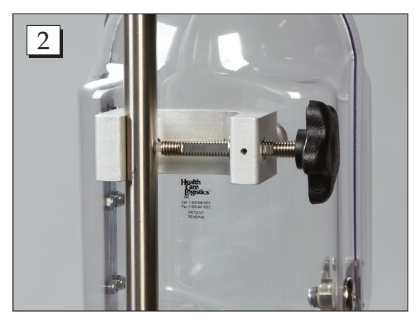
Step 2. Mount the pod to the IV pole and tighten the mounting knob.