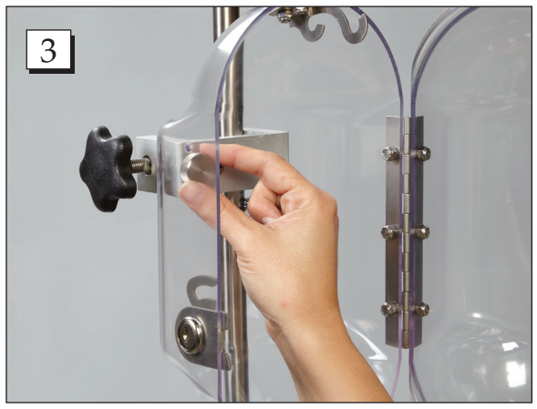
Step 3. Tighten the locking wheel on the inside of the pod.

Step 1. Open the pod and loosen the locking wheel on the inside of the box, and turn the mounting knob to make room for the pole.