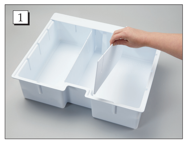
Step 1. Insert the two short dividers into the box slots near the middle indentation.