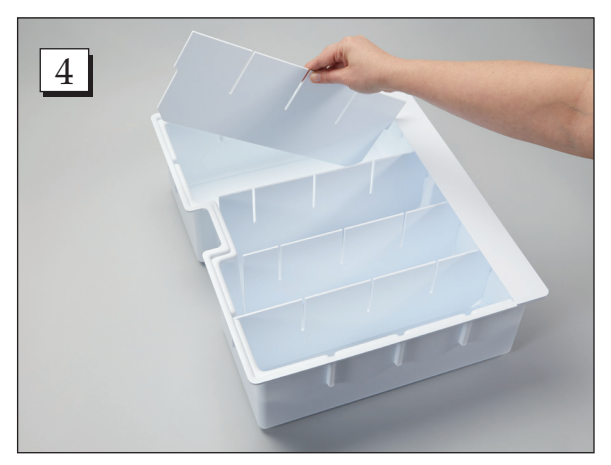
Step 4. Insert the two medium dividers into the box slots on each side of the short dividers.