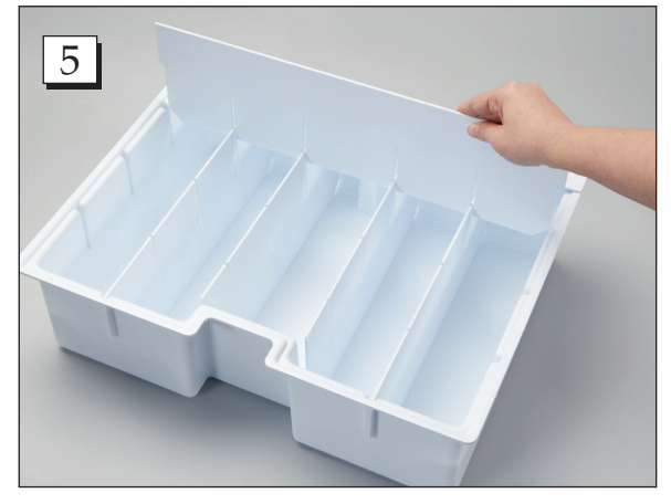
Step 5. Insert the three long dividers into the "U" shaped slots of the shorter dividers. The "U" shaped slots of the long dividers should face downwards so that the slots "nest" together.