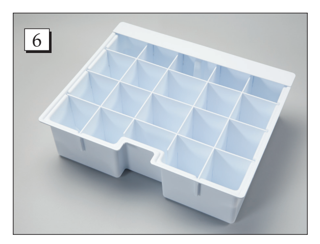
Step 6. Box will look like this with all dividers in place.