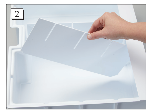
Step 2. The "U" shaped slots on the dividers should be facing up.