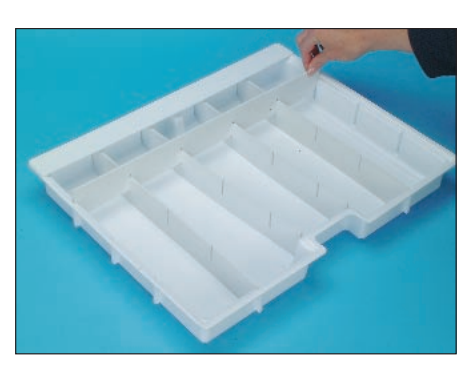
3. Insert the long dividers into the "U" shaped slots of the shorter dividers. The "U" shaped slots of the long dividers should face downwards so that the slots "nest" together.