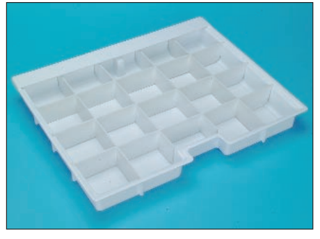
4. Box will look like this with all dividers in place.