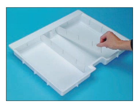
1. Insert the short dividers into the box slots near the middle indentation. The "U" shaped slots should be facing up.