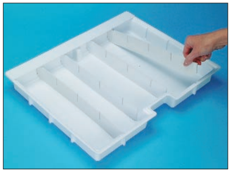
2. Insert the medium dividers into the box slots on each side of the short dividers.