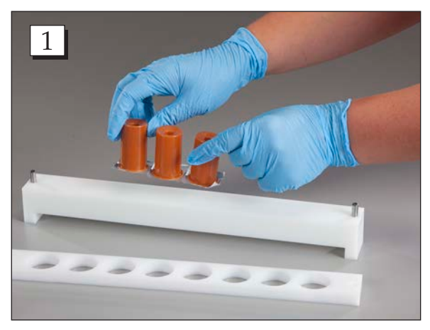
Step 1. Remove the top plate from the holder then place the vials top down onto the holder.