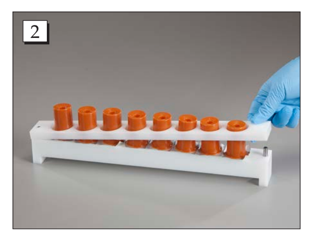
Step 2. Place the top plate over top of the vials locking them into place for the filling process.