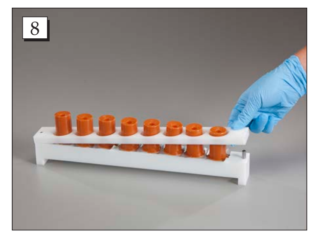
Step 8. After all the vials are sealed remove the top plate.