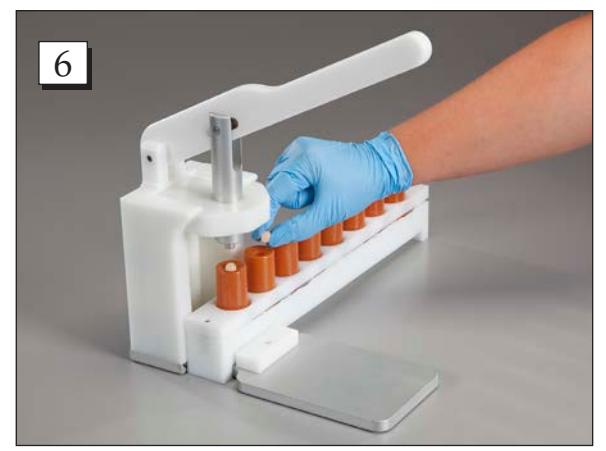
Step 6. Position the plugs into the end of each vial.