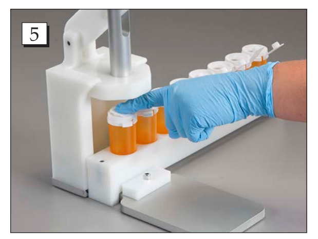
Step 5. Using your finger, push the tab down on the vial about to be sealed.