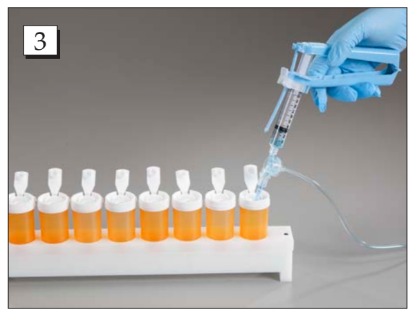
Step 3. Start at one end of the holder and fill the first vial. Continue moving from one vial to another until all of them are filled.