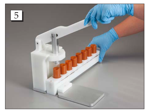
Step 5. Slide the holder into the channel base of the LUD Press.