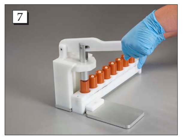
Step 7. Position the plug under the press and push down until you feel the plug push into place.