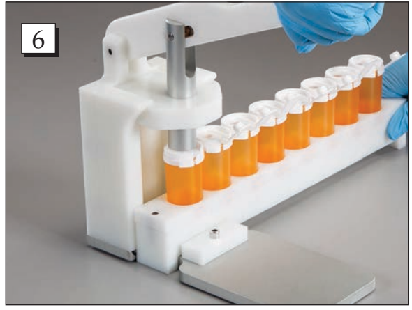
Step 6. Position the tab under the press of the and push down until you hear the tab snap closed.

Call Free 1.800.848.1633 • Fax Free 1.800.447.2923 Web: GoHCL.com • Email: hcl@GoHCL.com