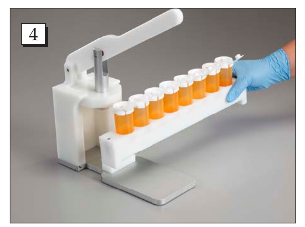
Step 4. Slide the holder into the channel base of the LUD Press. Make sure that the tabs are facing away from the press.