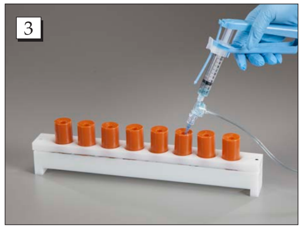
Step 3. Start at one end of the holder and fill the first vial. Continue moving from one vial to another until all of them are filled.