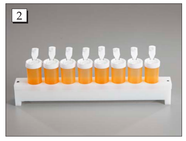
Step 2. Continue placing the vials in the holder so that all of the openings are aligned.