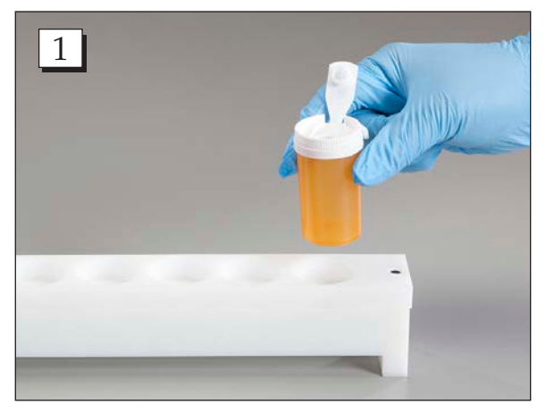
Step 1. Place the vials into the holes of the holder.