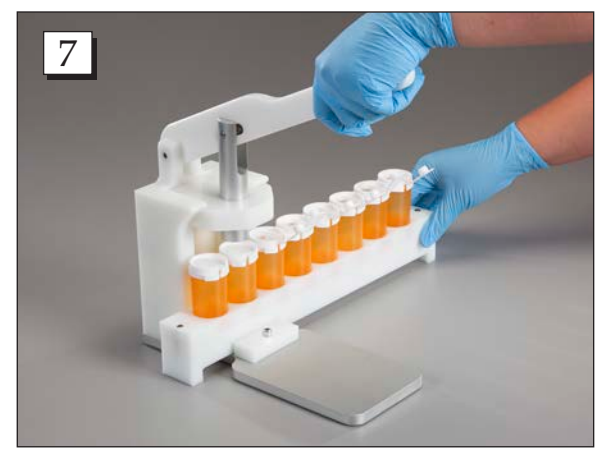
Step 7. Slide the holder forward to the next vial.

LUD Press & Holder for BD Tamper-Tuf<sup>™</sup> Vials with Caps (#18737 & 18738)