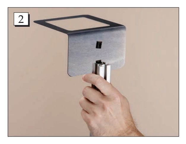
Step 2. Adjust the bracket to the desired height.