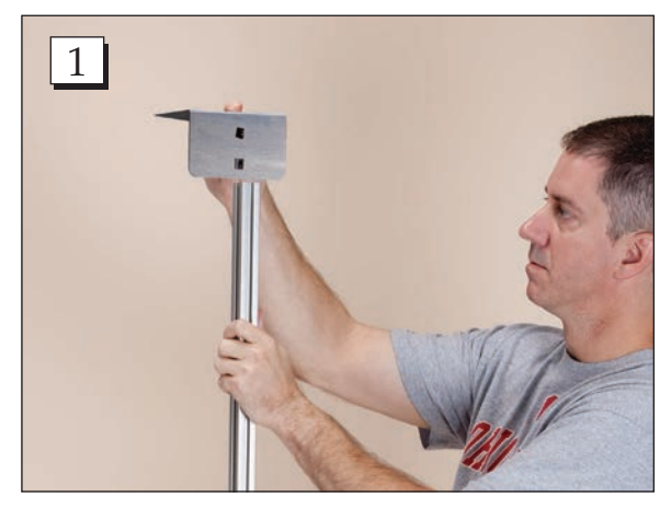
Step 1. Slide the T-Nuts on the bracket onto the pole.