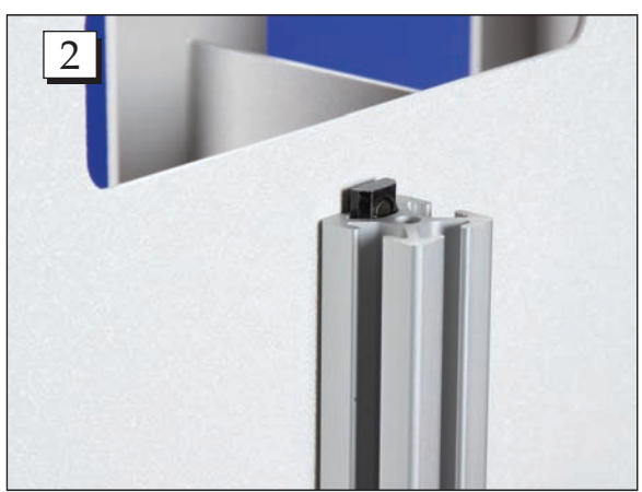
Step 2. Adjust the protection organizer to the desired height.