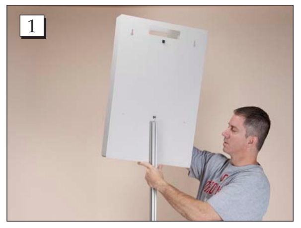
Step 1. Slide the T-Nuts on the protection organizer onto the pole.