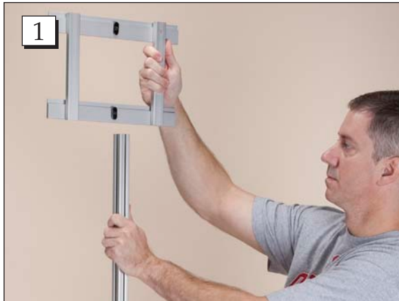
Step 1. Slide the T-Nuts on the bracket onto the pole.