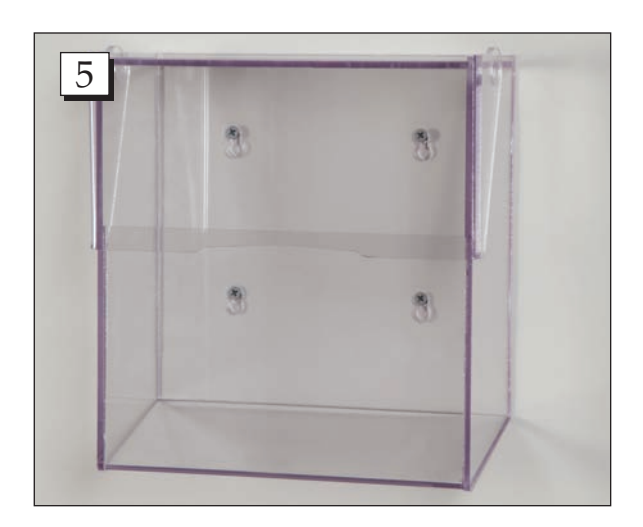
Step 5. Line up the dispenser to the screws.