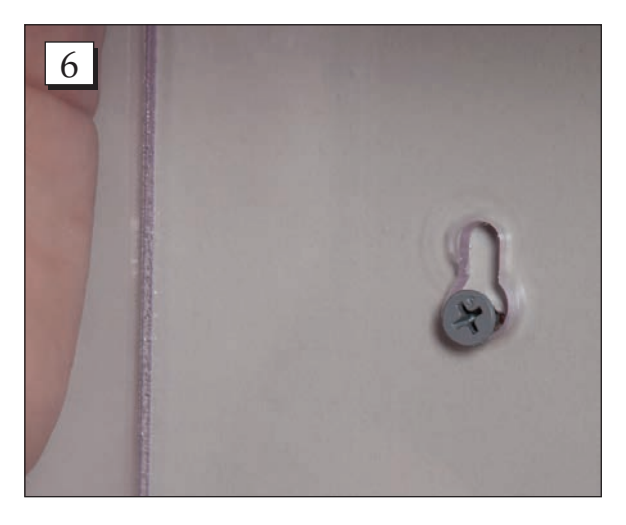
Step 6. Push the dispenser onto the screws through the largest part of the keyholes. Then pull the dispenser downward until the screws slide to the upper part of the keyhole.