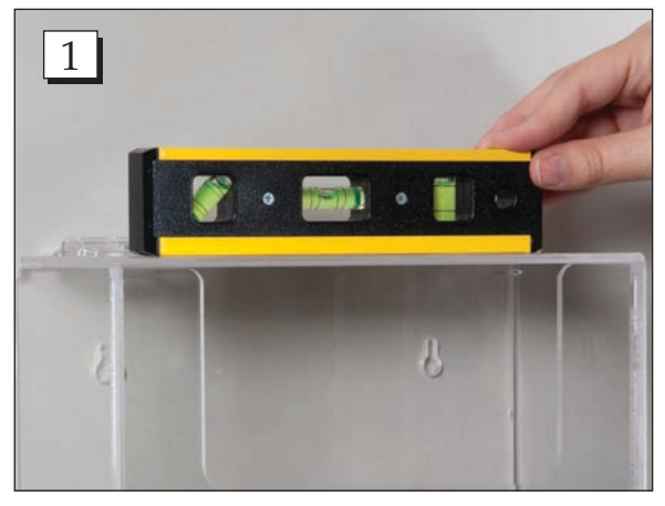
Step 1. Place the wall dispenser against the wall and use a level to straighten the dispenser.

NOTE: Be sure to select the appropriate mounting hardware to ensure safe and reliable use. Mount hardware through a stud, blocking or rigid structure where possible during installation.