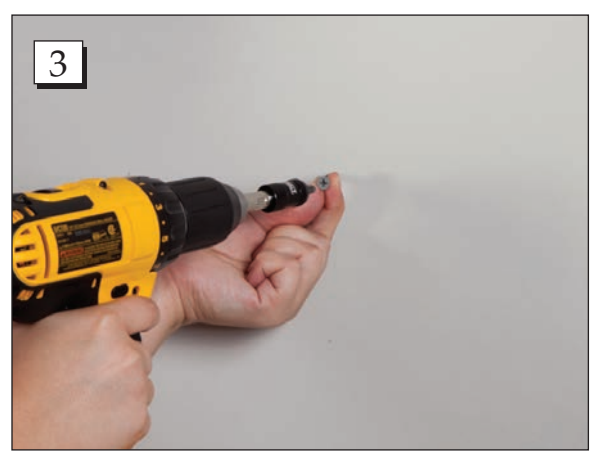
Step 3. Use a screwdriver to screw in 4 screws (not provided).