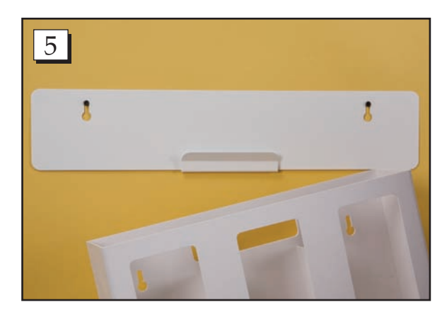
Step 5. Slide your protection organizer over the mount.