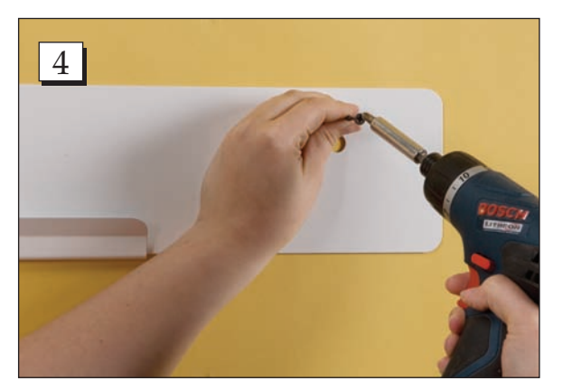
Step 4. Place a screw in the opposite side and tighten with a screwdriver.