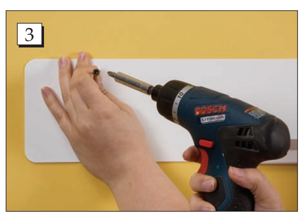
Step 3. Tighten with a screwdriver.