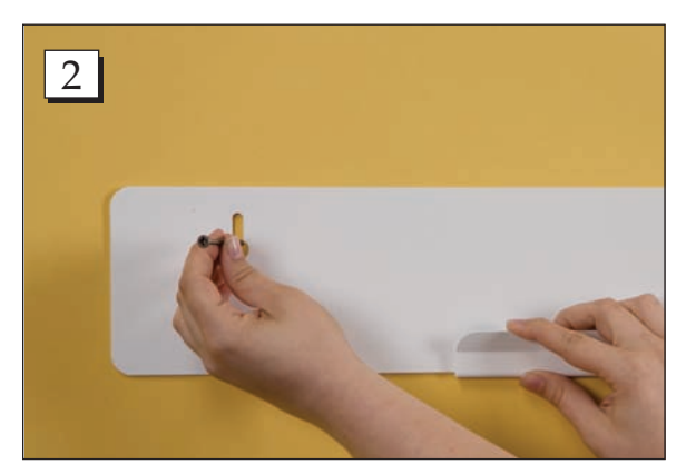
Step 2. Place a screw through the predrilled hole. (Screws not included.)