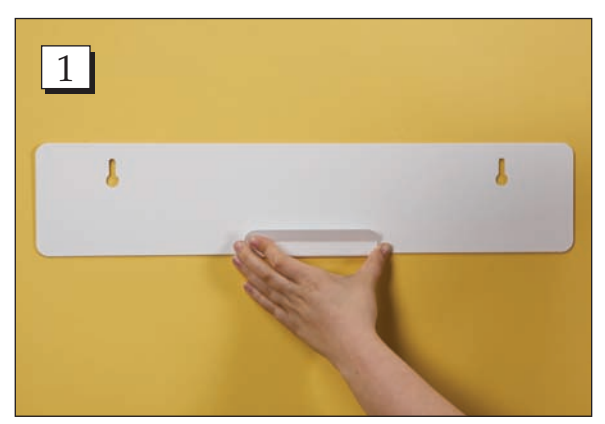
Step 1. Place the Wall Mount in desired location.