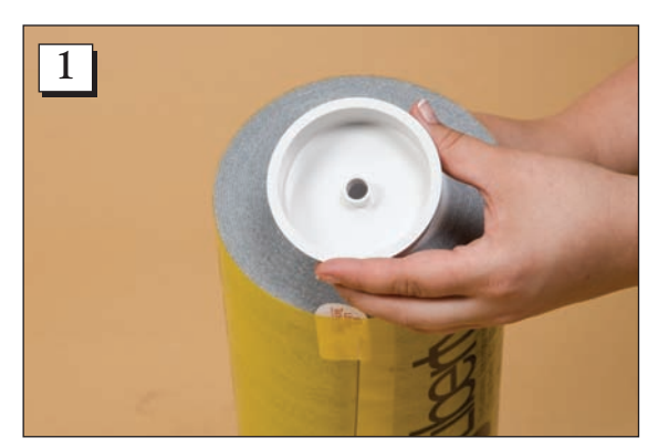
Step 1. Gather one end cap and the tacky roll. Place the end cap in the open end of the tacky roll.