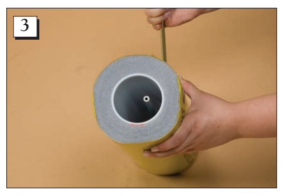
Step 3. Flip the entire unit over to expose the other open end of the tacky roll.