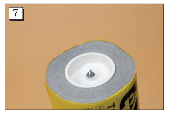
Step 7. Tighten until secure.