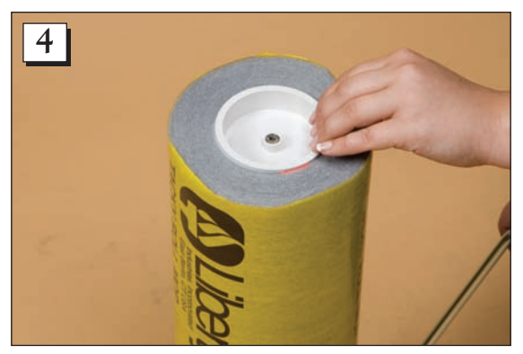
Step 4. Place the remaining end cap in the open end of the tacky roll. Be sure to line up the axle with the hole in the bottom of the end cap.