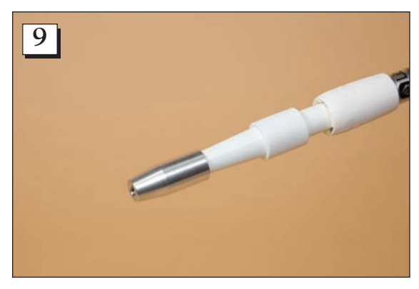
Step 9. Tighten the threaded end cap onto the end of the handle.