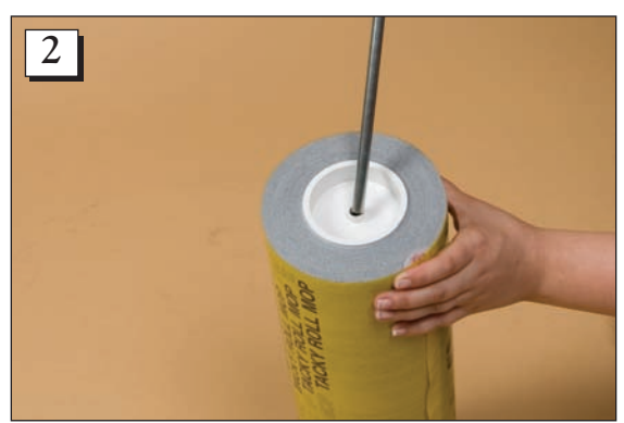
Step 2. Slide the axle through the opening in the bottom of the end cap.