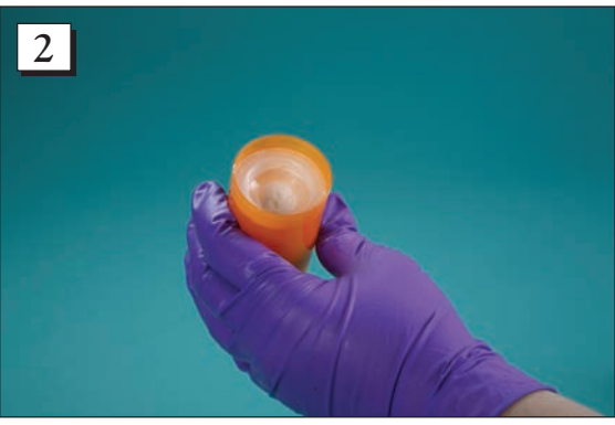
Step 2. Do not exceed the bottom of the neck.