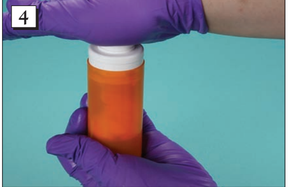
Step 4. Press firmly with the heal of your palm until the actuator clicks into place.