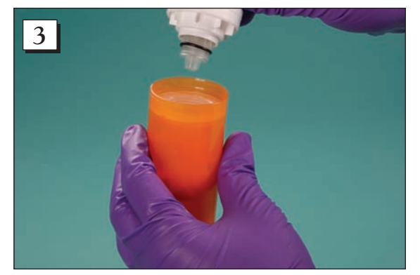
Step 3. Place the actuator into the opening of the pouch.