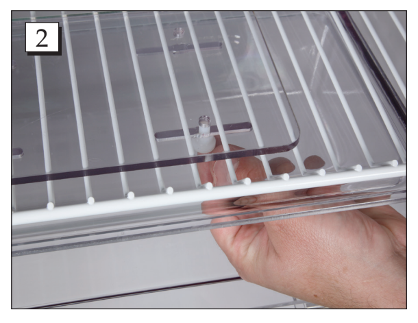
Step 2. Thread screw from the inside of the box through the rack into the retention plate - (trap refrigerator rack between box and retention plate).

Retention Plate (with 4 threaded holes - no nuts required.)