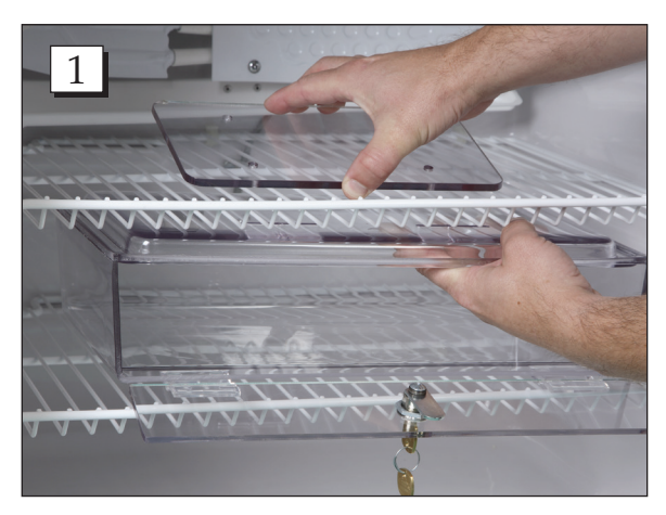
Step 1. Place hand inside box and hold into place while placing retention plate on top of refrigerator rack.

Refrigerator Box (#17508, 17524, 17525, 17526)