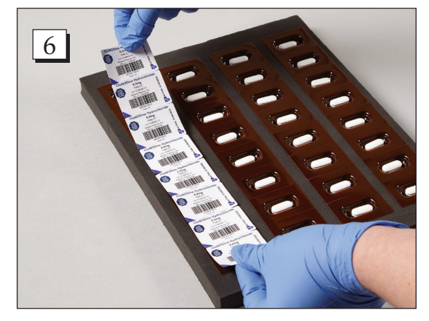
Step 6. Holding the label strip by the edges on either end, apply the label strip to a row of blisters in the sealing tray by matching the notches on the labels with the edges of the blisters.

Call Free 1.800.848.1633 • Fax Free 1.800.447.2923