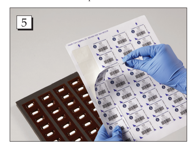
Step 5. Peel a strip of labels from the 8\frac{1}{2} " x 11" sheet of laser labels.