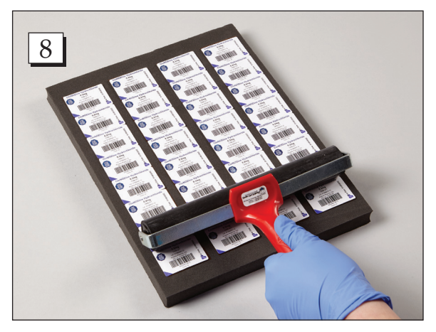
Step 8. Enhance the seal by applying moderate pressure to the sealed blister strips using a sealing roller.