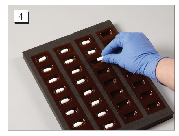
Step 4. Fill each blister cavity with a tablet or capsule.