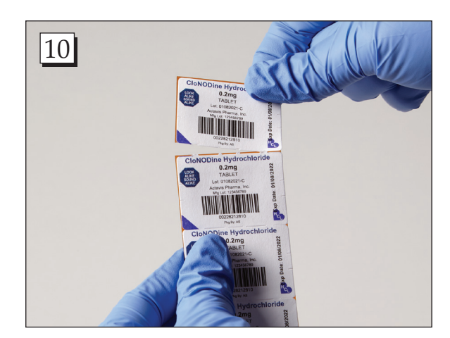
Step 10. Each blister can be torn from it's strip and stored or dispensed to the patients.