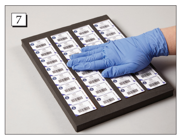
Step 7. Gently press the labels onto the blisters.