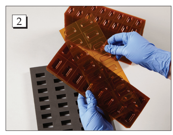
Step 2. Remove a sheet of two blister strips from the blister stack.