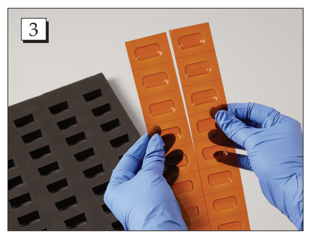
Step 3. Tear the sheet into two individual blister strips and place them in the tray. Repeat steps 2 & 3 for two more blister strips.