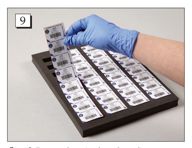
Step 9. Remove the strips from the sealing tray.