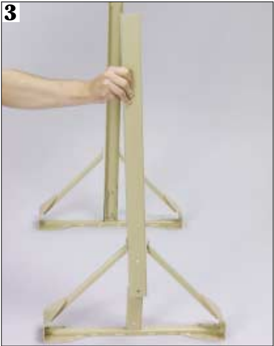
3. Attach the other vertical bar to the second base unit.