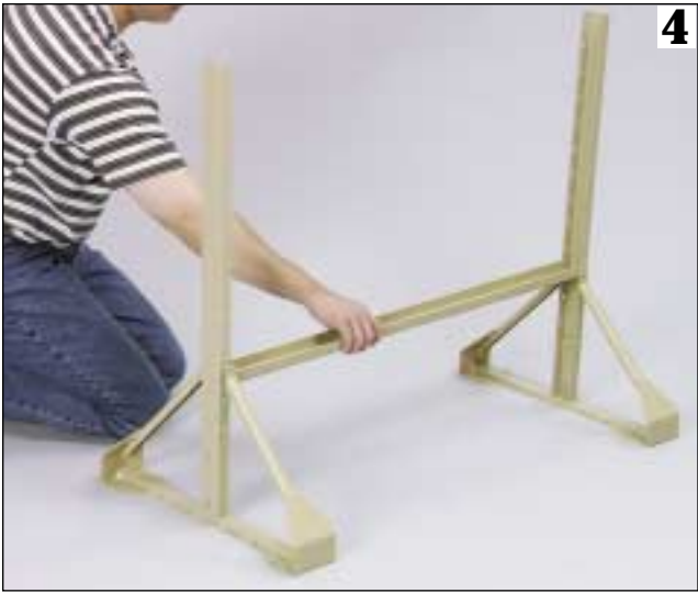
4. Place the first horizontal bar in between the two base units and the vertical bars.

Call Free 1 800 848 1633 or 888 HCL INTL® (425 4685) • Fax Free 1 800 447 2923