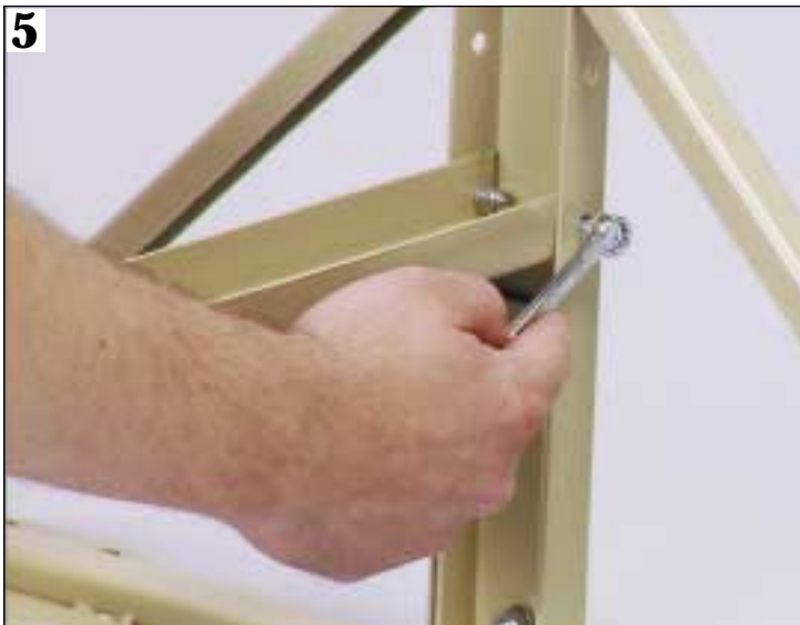
5. Screw the horizontal bar onto the vertical bar.