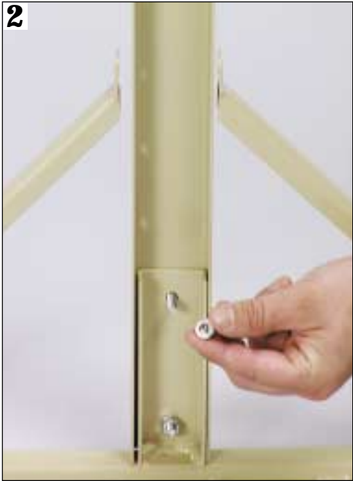
2. Screw two screws to keep the vertical bar in place.