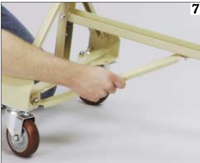
7. To make sure the cart is secure, attach a horizontal brace from the first horizontal bar to the wheel of the base unit.

Call Free 1 800 848 1633 or 888 HCL INTL® (425 4685) • Fax Free 1 800 447 2923