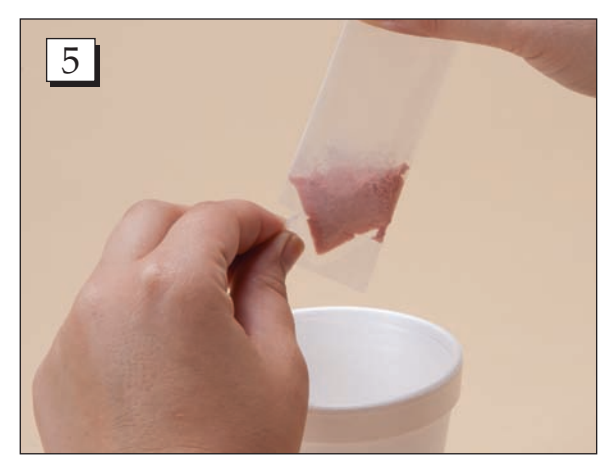
Step 5. Position the bag over juice, applesauce, pudding, or cup. Tear bottom of bag at perforation.