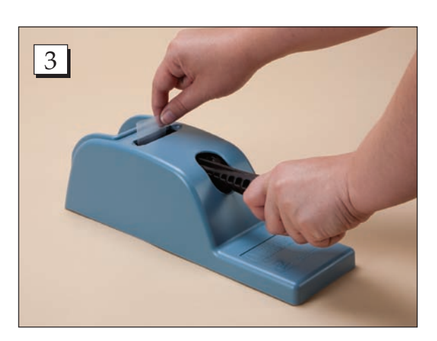
Step 3. Press the handle gently down to crush the tablets. The handle will need to be pressed down 2 or 3 times while the tablet crusher bag is in position. Do not tap. Only light pressure is required to crush tablets.