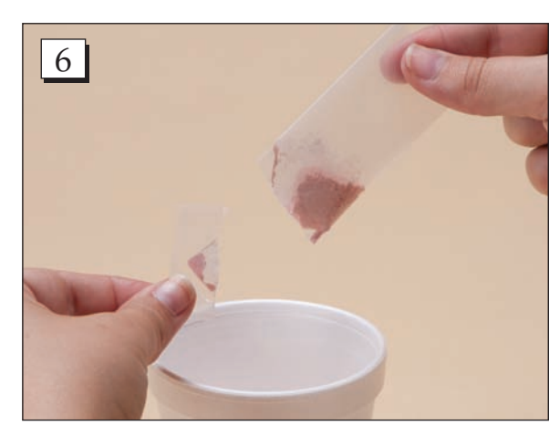
Step 6. Pull to remove the entire perforated strip.