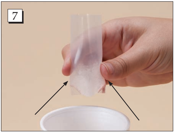
Step 7. Squeeze the outside of the bag and the unique funnel shaped bag bottom allows the crushed medication to easily pour out.

Note: The unique perforation design allows medication to travel less distance while emptying, ensuring a more accurate dose delivery.