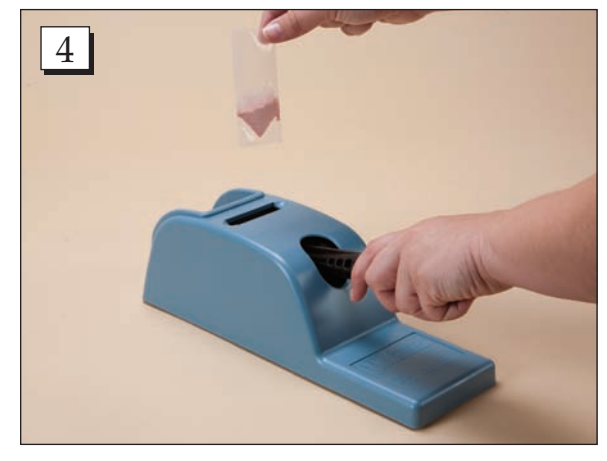
Step 4. Crushed tablets are ready to be administered from the crusher bag.