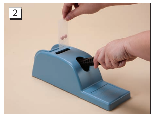
Step 2. Remove a crusher bag from the storage box located in the crusher's bag storage area. Place tablet(s) in the crusher bag