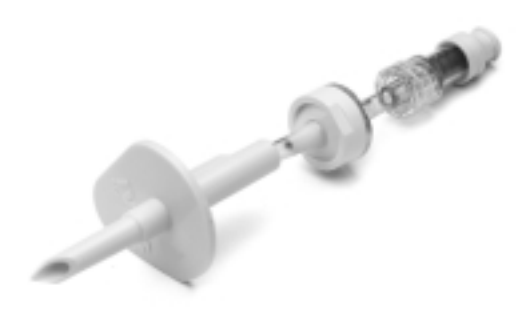
Bag Spike with Check Valve and SmartSite Sterile SmartSite needle-free bag access spike with check valve.