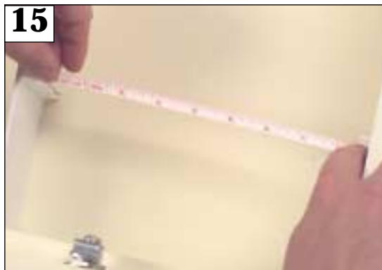
15. Measure the distance from the center of one holder to the center of the other.