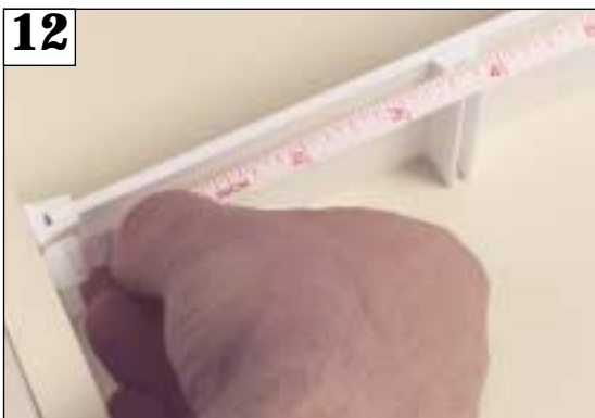
12. Measure from the front of the drawer to the back of the holder to determine the location to place the holder at on the right side of the drawer.