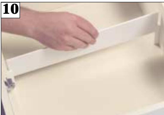
10. Slide the divider between the front and back holders.