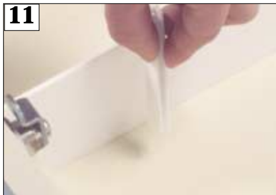
11. Decide the position you would like your next divider. This divider is going to be side to side. Measure and mark the side of the first divider where the next holder will be. Peel away another holder's adhesive and press it onto the mark.