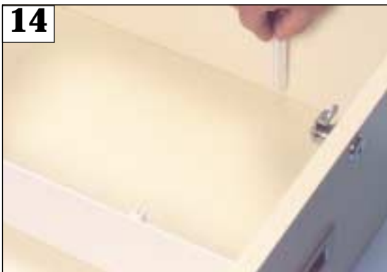
14. Peel the adhesive backing from the holder and press the holder onto the new mark.