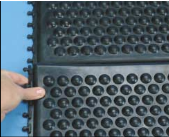
1. Align the corners of the mats.