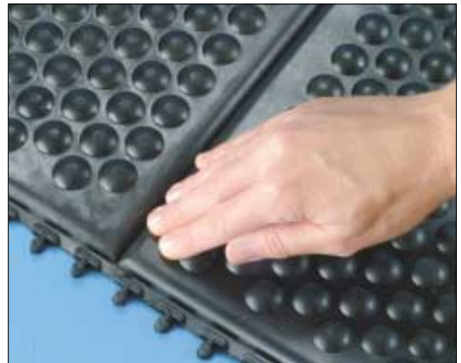
4. Tap the mats together by using a rubber mallet or by pressing them together with your hand.