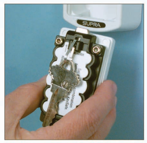
7. Attach your keys to the key ring or insert them into the box.