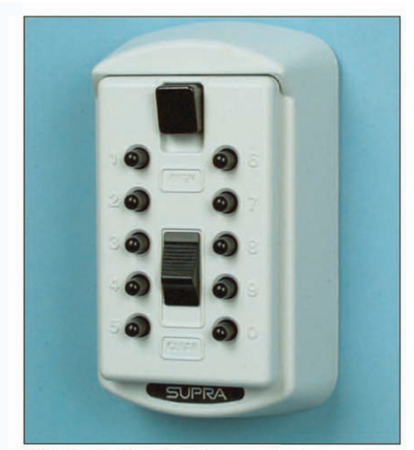
10. The Locking Key Storage Box is now ready for use.