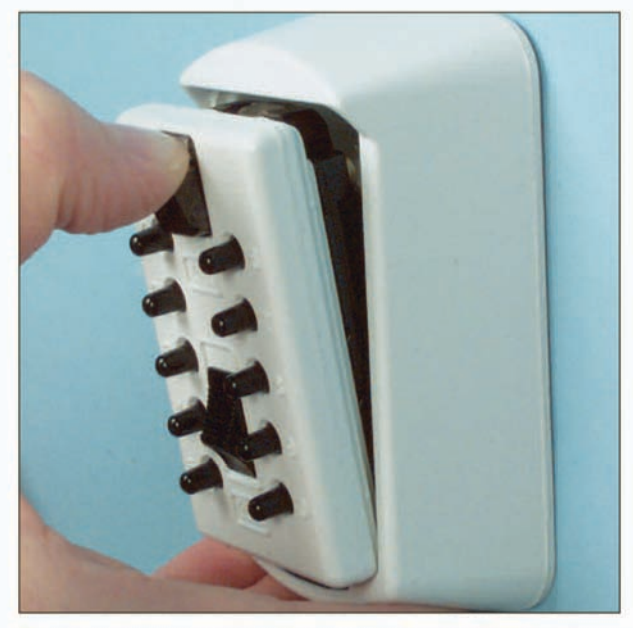
9. Press the open button down and snap the front cover back onto the box.