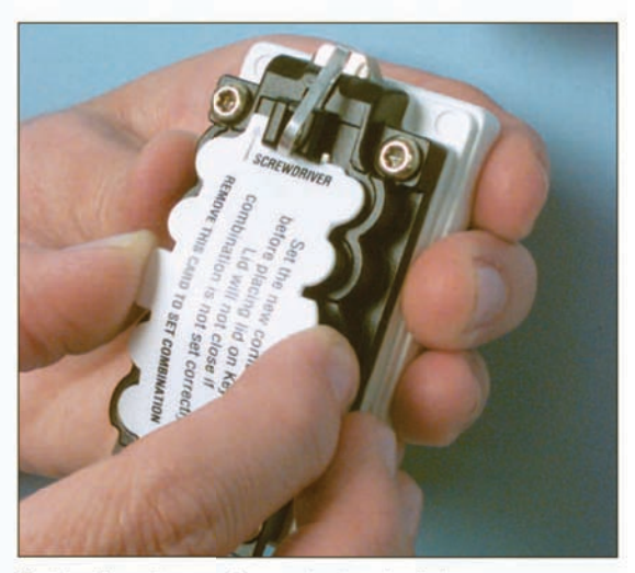
Position the card onto the back of the front cover of the Locking Key Storage Box for future use.