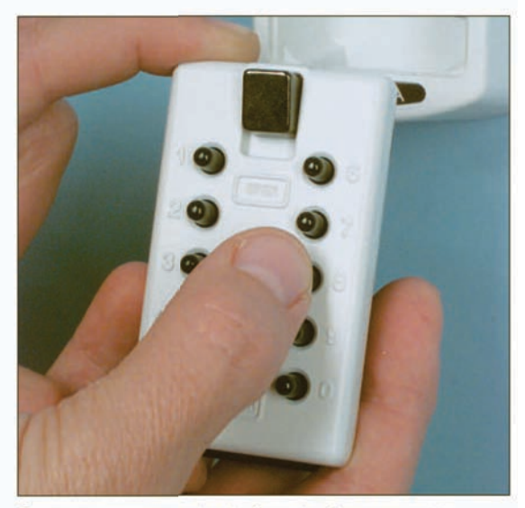
8. Try the combination before the front cover is put back on the Key Storage Box to make sure the box will open.

Call Free 1.800.848.1633 or 1.888.HCL-INTL Fax Free 1.800.447.2923 Website: www.HealthCareLogistics.com • Email: hcl@HealthCareLogistics.com