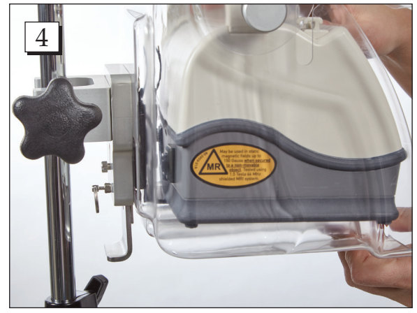
Step 4. Roll the pump into place. Note: When properly seated the pump cannot be lifted out of the locking mount.