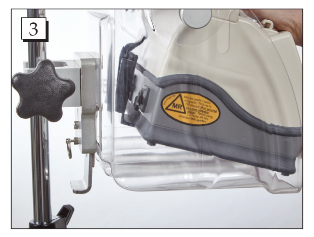
Step 3. Tilt the pump slightly towards you when inserting into the locking mount.