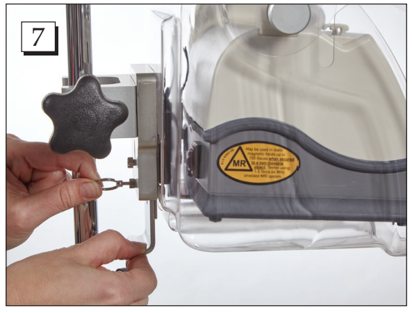
Step 7. To remove the pump, pull the release ring out and then pull the locking plate down to unlock the unit.