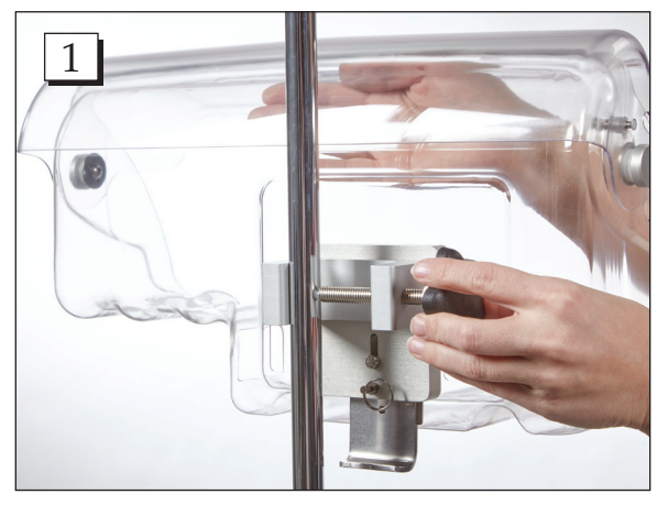
Step 1. Mount the cover to your IV pole.