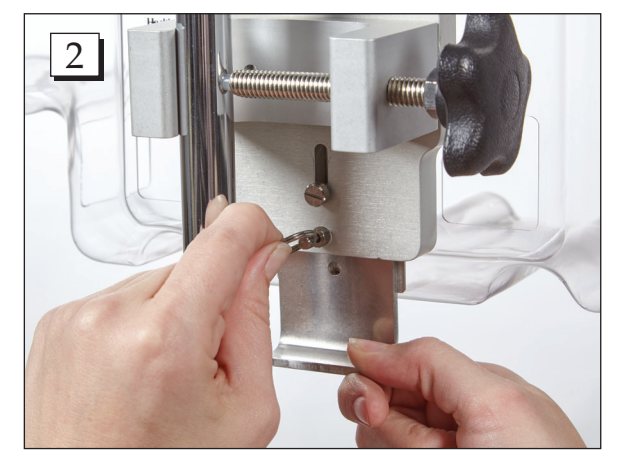
Step 2. Pull the release ring out and then pull the locking plate down to unlock the unit.