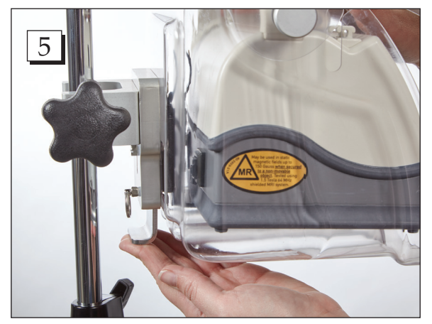
Step 5. Push the pump back against the mount and then push the locking plate up to lock the pump into place.