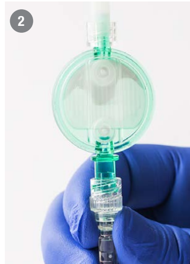
2 Ensure that the filter is vertical and below the level of the solution container, Open administration set clamp and slowly prime filter.