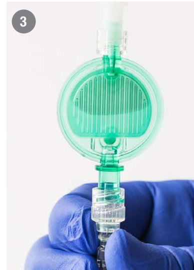
3 Once fully primed during priming rotate filter to view the ribbed side.