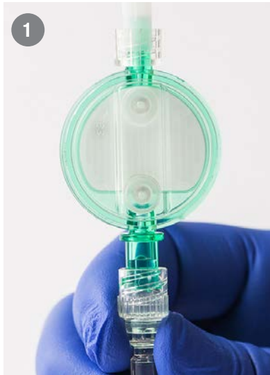
1 Hold filter and luer adaptor in upright position as shown, with plain (non ribbed) side facing.