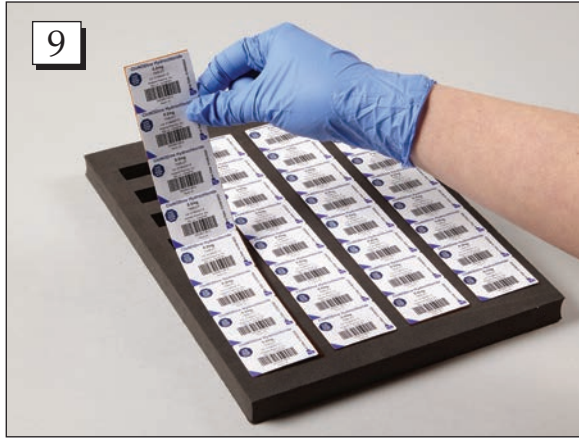
Step 9. Remove the strips from the sealing tray.