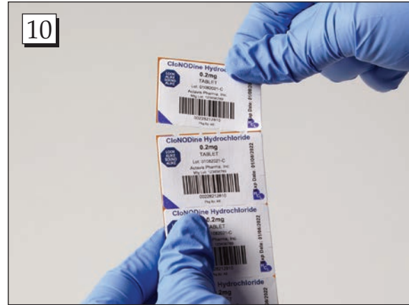
Step 10. Each blister can be torn from its strip and stored or dispensed to the patients.