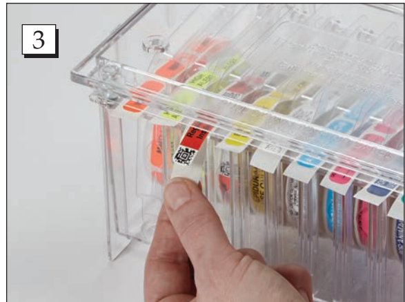
Step 3. Pull straight down on the label liner to automatically peel and dispense a label.

Note: For larger labels remove the necessary tines. To remove the tines use a pair of pliers push the tine back into the box and to one side for a clean break.