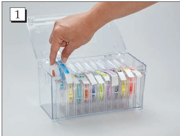
Step 1. Insert blister packed labels into each track.