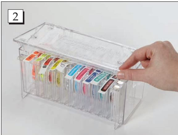
Step 2. Close the lid.