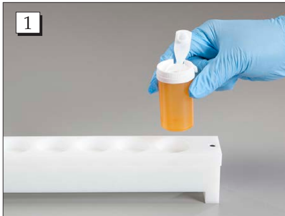
Step 1. Place the vials into the holes of the holder.