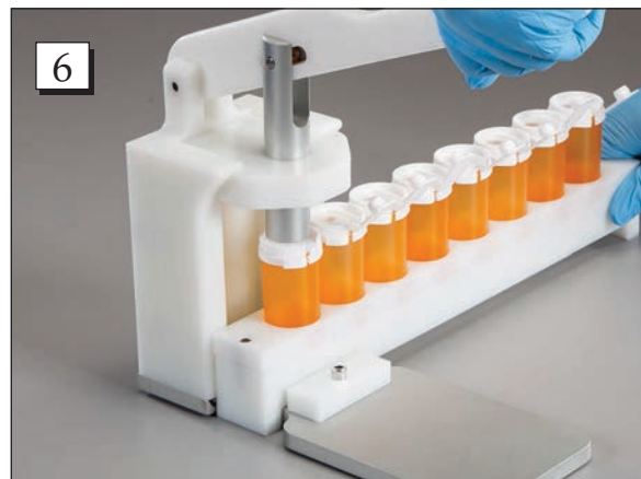
Step 6. Position the tab under the press of the and push down until you hear the tab snap closed.

Call Free 1.800.848.1633 • Fax Free 1.800.447.2923