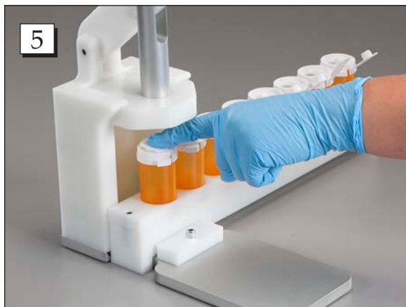
Step 5. Using your finger, push the tab down on the vial about to be sealed.