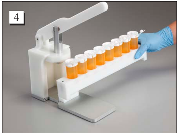
Step 4. Slide the holder into the channel base of the LUD Press. Make sure that the tabs are facing away from the press.