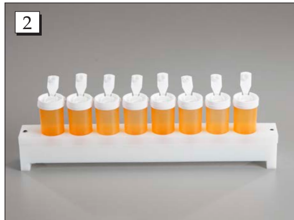
Step 2. Continue placing the vials in the holder so that all of the openings are aligned.