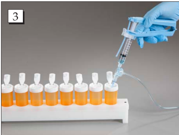
Step 3. Start at one end of the holder and fill the first vial. Continue moving from one vial to another until all of them are filled.