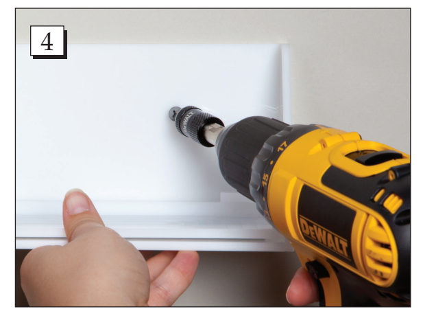
Step 4. Loosely drive the screw into the desired location on the wall or cabinet. (Screws are not provided.)

Call Free 1.800.848.1633 • Fax Free 1.800.447.2923