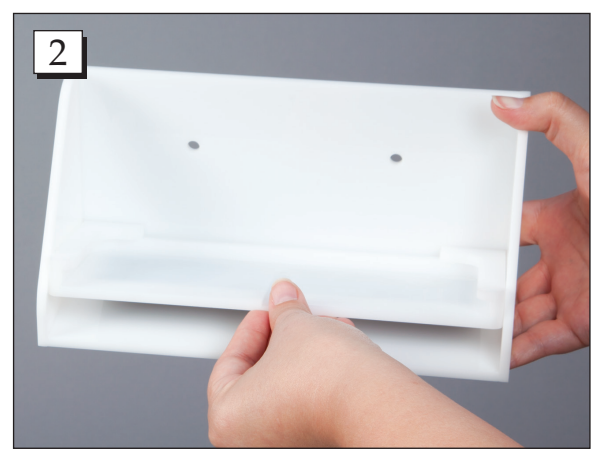
Step 2. Place the Receiving Base in the Wall Mount or on countertop, cart top or shelves.