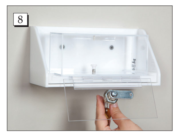
Step 8. Unlock the box.