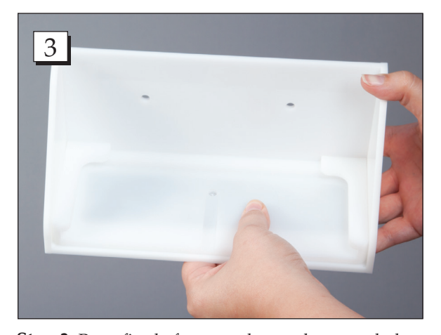
Step 3. Press firmly for several seconds to attach the Receiving Base.