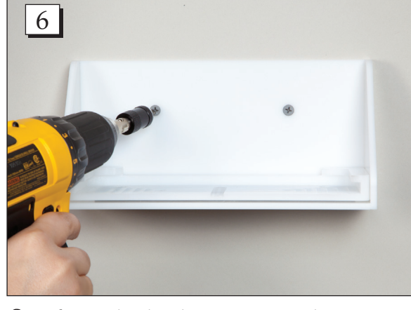
Step 6. Once level, tighten screws into the remaining holes.