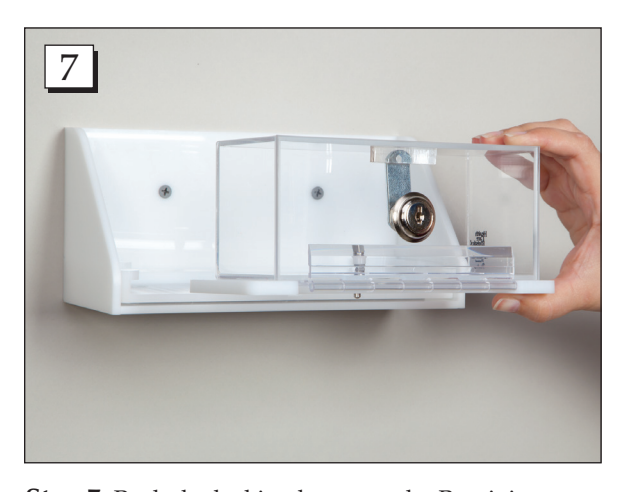
Step 7. Push the locking box onto the Receiving Base. Continue pushing until the locking box clicks into place.