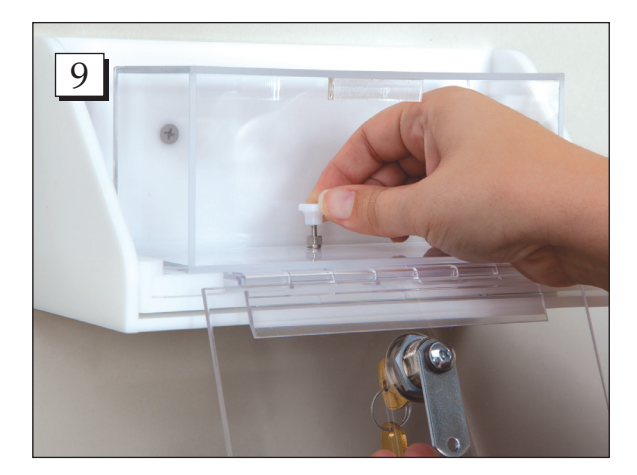
Step 9. Pull up of the white button in the middle of the locking box. While pulling up on the button, pull the entire box forward off of the Receiving Base.