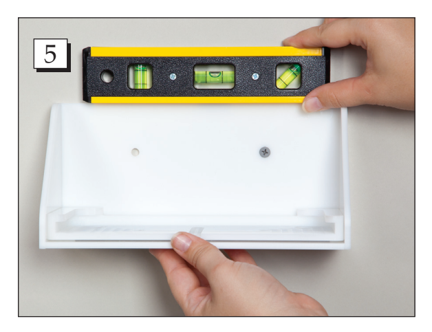
Step 5. Place a level on top of the Wall Mount.

Lock & Locate<sup>™</sup> Boxes (#18670 & 18675)