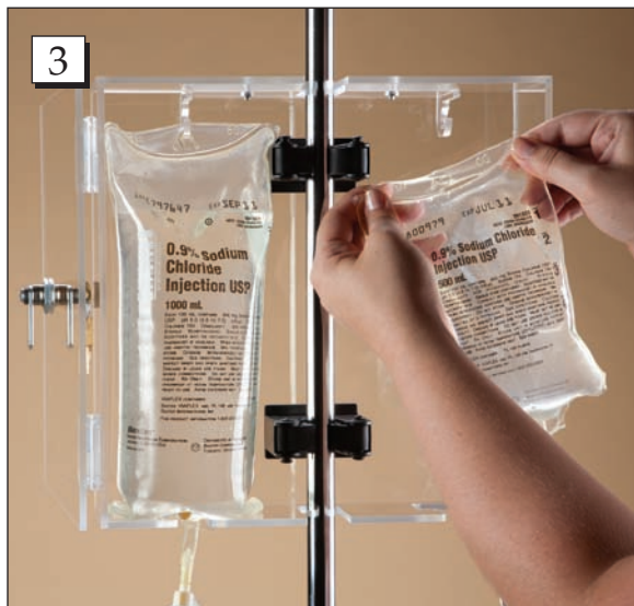
Step 3. Hang the IV bags on the hooks.