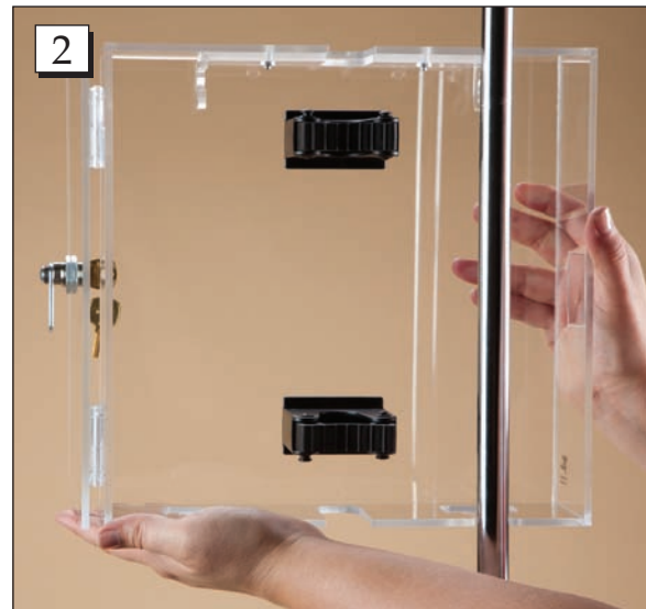
Step 2. Align the clamps on the inside of the box with your pole. Holding the box with your four fingers and the pole with your thumb, press firmly until the clamps wrap around the pole.