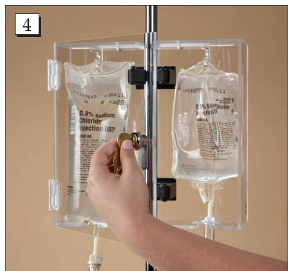
Step 4. Lock the IV box door.

Call Free 1.800.848.1633 • Fax Free 1.800.447.2923 Web: GoHCL.com • Email: hcl@GoHCL.com