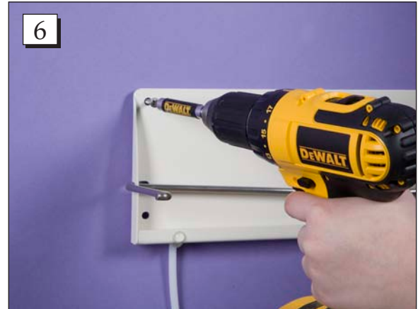
Step 6. Tighten the screw with a screwdriver and repeat with the remaining three mounting holes.