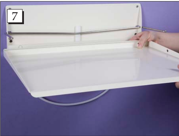
Step 7. Now replace the desktop.