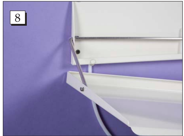
Step 8. Slide the metal leg into its notch on one side.