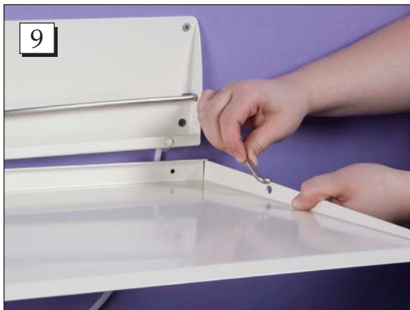
Step 9. Push in on the opposite metal arm to place it in its notch.