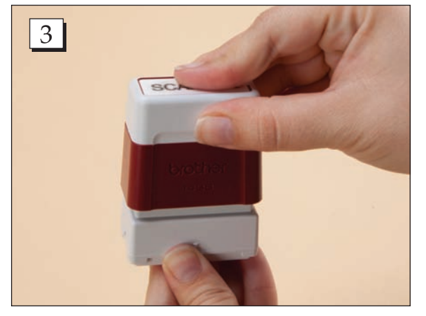
Step 3. Replace the handle on the stamp.