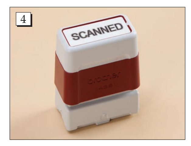
Step 4. Let the stamp sit upright for approximately three minutes to allow the ink to spread.