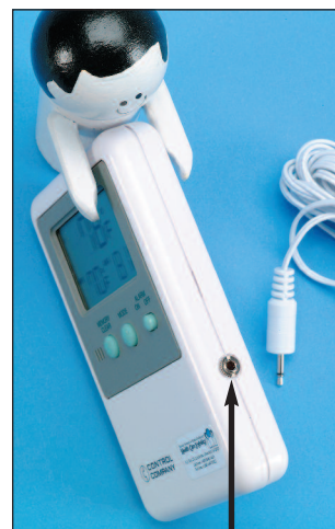
Jack for the temperature buffered-sensor